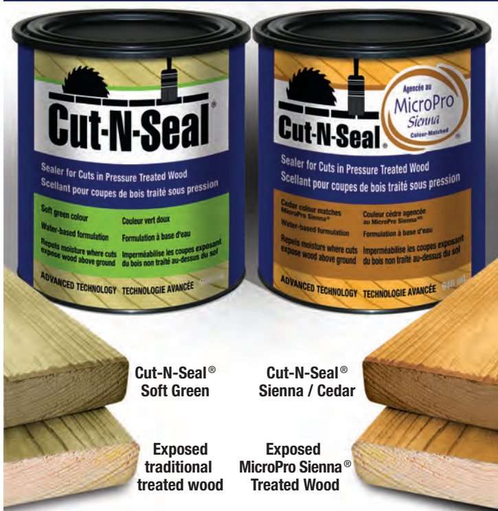
Cut-N-Seal® Soft Green